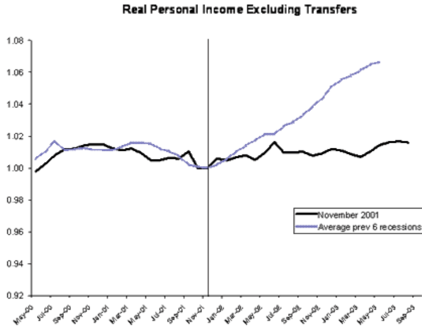
Figure 2. Real Personal Income Less Transfers

The dark line shows the movement of income from May 2000 to the present and the shaded line the average over the previous 6 recessions.