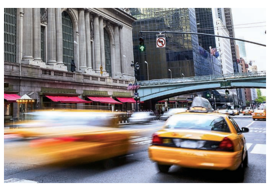
Privacy is breached when "secure" data can be linked with publicly available data.

Dwork, McSherry, Nissim, and Smith formulated this definition, showed it captures basic intuitions about privacy, and devised research protocols that provide \varepsilon -differential privacy ( 13 ). Data are held by a trusted curator who only accepts certain questions from the investigator. The curator performs